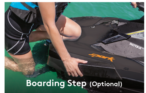
Boarding Step (Optional)

Designed to improve freedom of movement while riding.