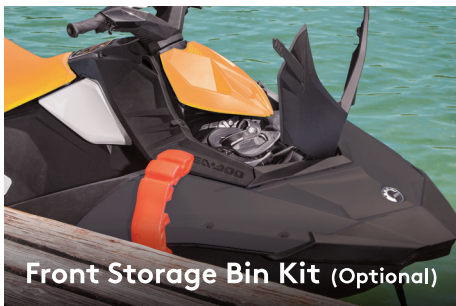
Front Storage Bin Kit (Optional)

Two fuel efficient, compact and lightweight Rotax ® engine options.