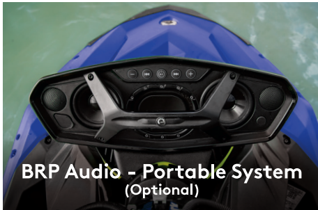
BRP Audio - Portable System (Optional)

High-quality, waterproof 50-watt Bluetooth ® portable sound system.