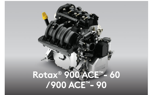
Rotax® 900 ACE™ - 60 /900 ACE™ - 90

This innovative composite plastic is robust and more scratch-resistant than fiberglass. Plus, it's weight savings help to deliver impressive performance and efficiency.